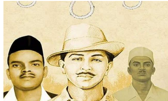
Shaheed Diwas or Martyrs' Day is observed on March 23 , organized by Department of History